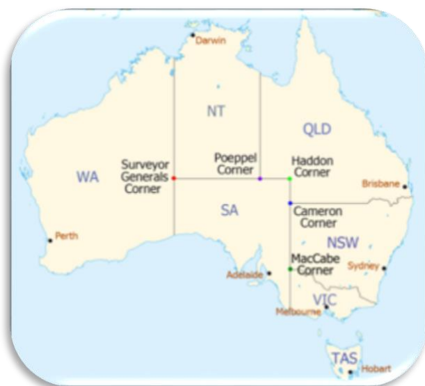
Map of all the 'Corners'

(MacCabe Corner is named for Francis MacCabe, a surveyor who did considerable work exploring and mapping New South Wales, in particular the rivers of the Murray-Darling basin)