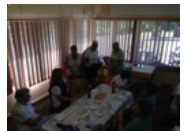
Alpine Trophy winners