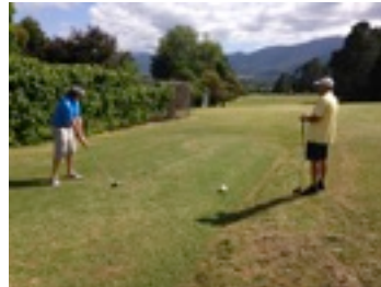
Webby admiring Myrtleford's form

Thanks to the ladies for catering the day.