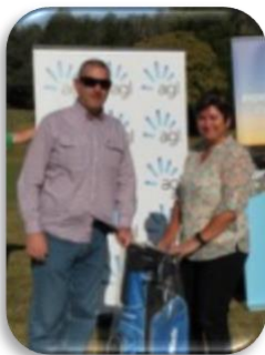
Ladies PIA Champion