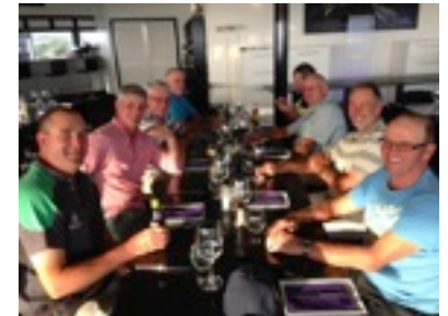
Waiting for Crayfish

As you may recall we were divided into two teams - President's v Vice President's. Day 1 and the scores were fairly tight with the Presidents team ahead. Day 2 at Ocean Dunes sorted the wheat from the chaff and the VP's team was then ahead. Plenty of strategy was talked at the bar that night - I won't mention the afore golf activities, what happens on King Island stays on King Island!, except to say the Crayfish, wine and cheese were fantastic!