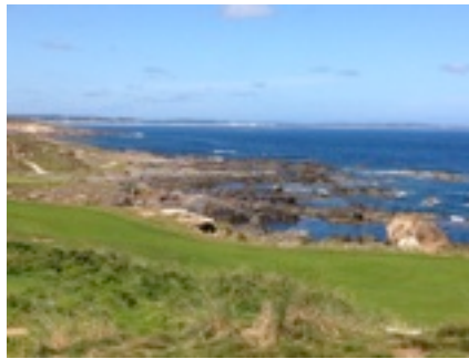
Great views, very distracting Cape Wickham