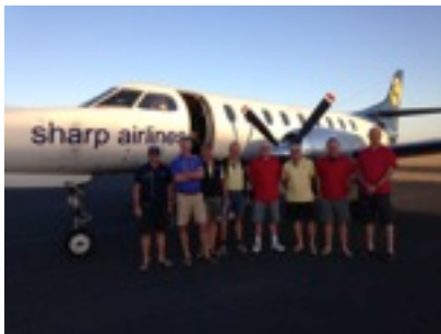
23 seats for 8 people! however NO business class :-(

Despite this disappointing setback we all jumped in cars and enthusiastically made our way to Albury.