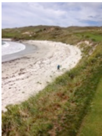
2nd shot on the 18th! Cape Wickham