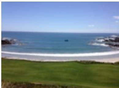
Stunning views - Cape Wickham

The 3 shots on the last page sums up the difficulty of both of these courses. This was a common sequence of events for a lot of us.