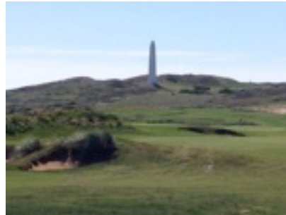
Johnsy eagled this Par 4

The day was magnificent and thoroughly enjoyed by all, even if the scores did not reflect our enthusiasm.