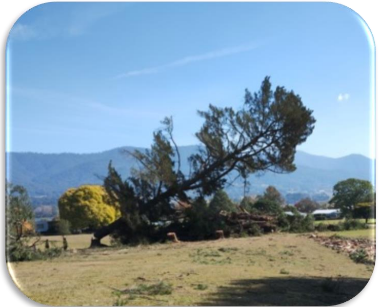
The skills of local Tru Tree Care in Felling our pines onto the burn pile on the 7th