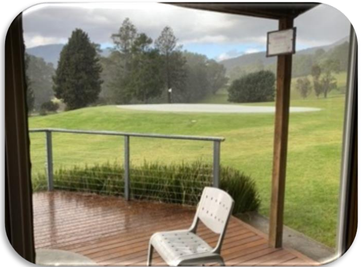
Hail on the 18th on the same day