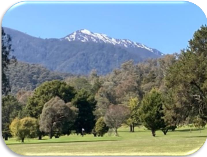
West Peak on a glorious 23 September