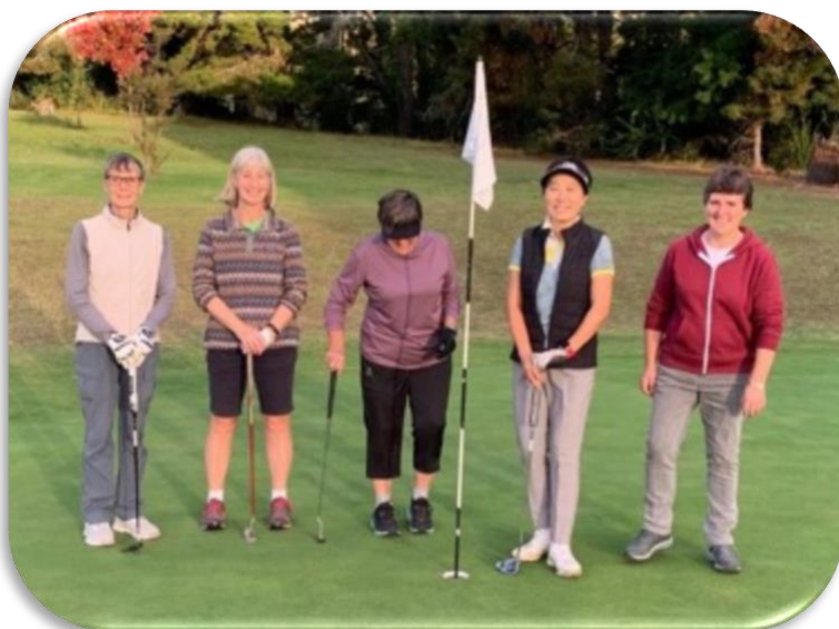
The Sunday Social Golfers