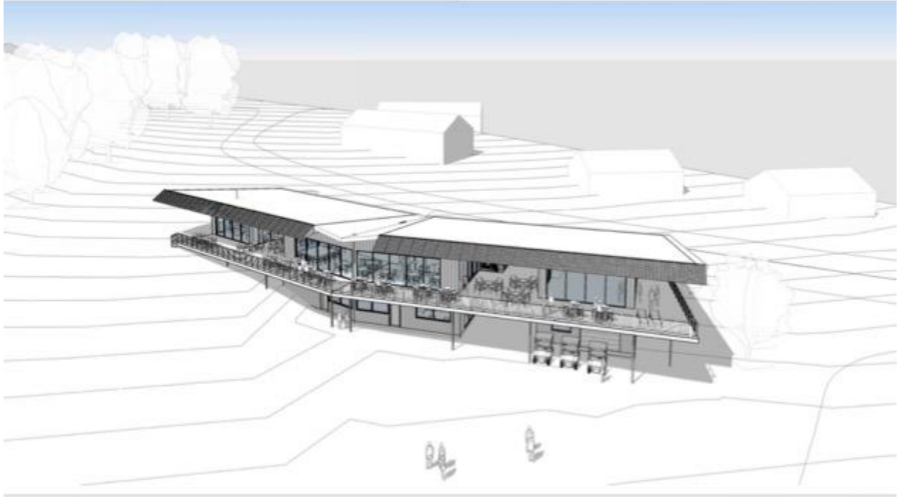
Upper Kiewa Valley Recreation & Community Hub Concept Design

As you are probably aware we were unsuccessful with our first application for a grant to build a new community/club/F&B facility on the site of the existing clubhouse. After extensive consultation with the appropriate grant people the Clubhouse Sub-Committee has updated the application & put a number of important paperwork issues into place for a second attempt at a grant.