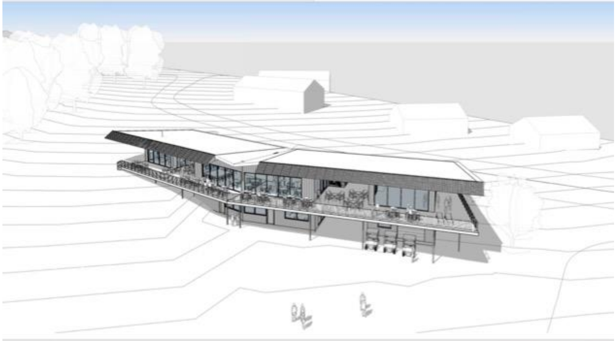
Upper Kiewa Valley Recreation & Community Hub Concept Design

As you are probably aware we were unsuccessful with our first application for a grant to build a new community/club/F&B facility on the site of the existing clubhouse. After extensive consultation with the appropriate grant people the Clubhouse Sub-Committee has updated the application & put a number of important paperwork issues into place for a second attempt at a grant.