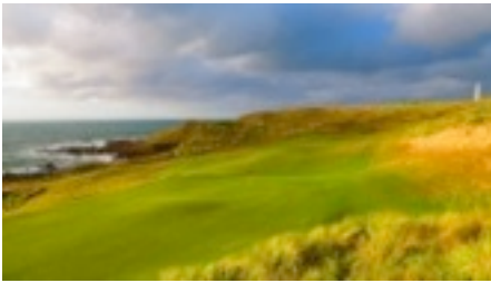
Ocean Dunes http://www.oceandunes.com.au