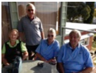
Handicap Winners & Runners Up