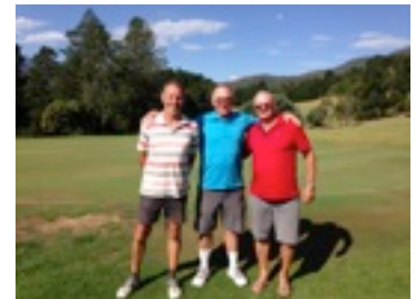
'Yellow Ball' team winners