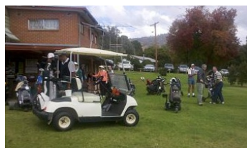
Most of the field, anxious to begin.

Next up was the traditional ANZAC Day Mixed & Men's Canadian. Two of these in very quick succession can reek havoc with marital relationships! Captain please take note - & there is another on Sunday May 12!