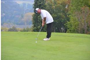
Ex-Pres, & current 'Greenkeeper', putting the 18 th .