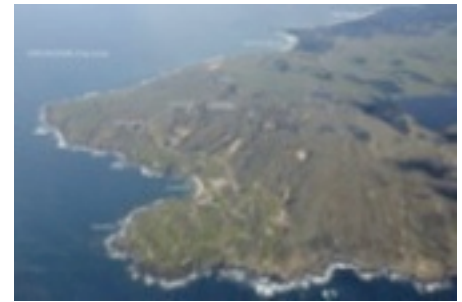
Cape Wickham GC

Odds as to who will win, players divided into President's and Vice-President's teams, form guides written, bar stools warmed and dinner reservations made, a great time will be had by all. Full report next newsletter.