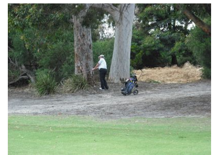
El Presidente in trouble