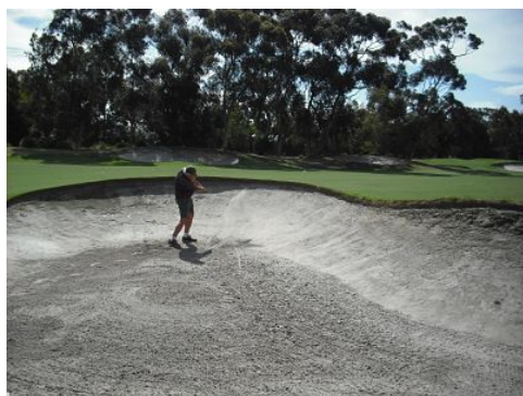
El Capitain in the sand