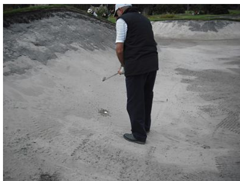
Webby's poached egg for breakfast!