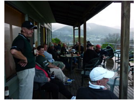
The gallery with the best view of the finishing teams